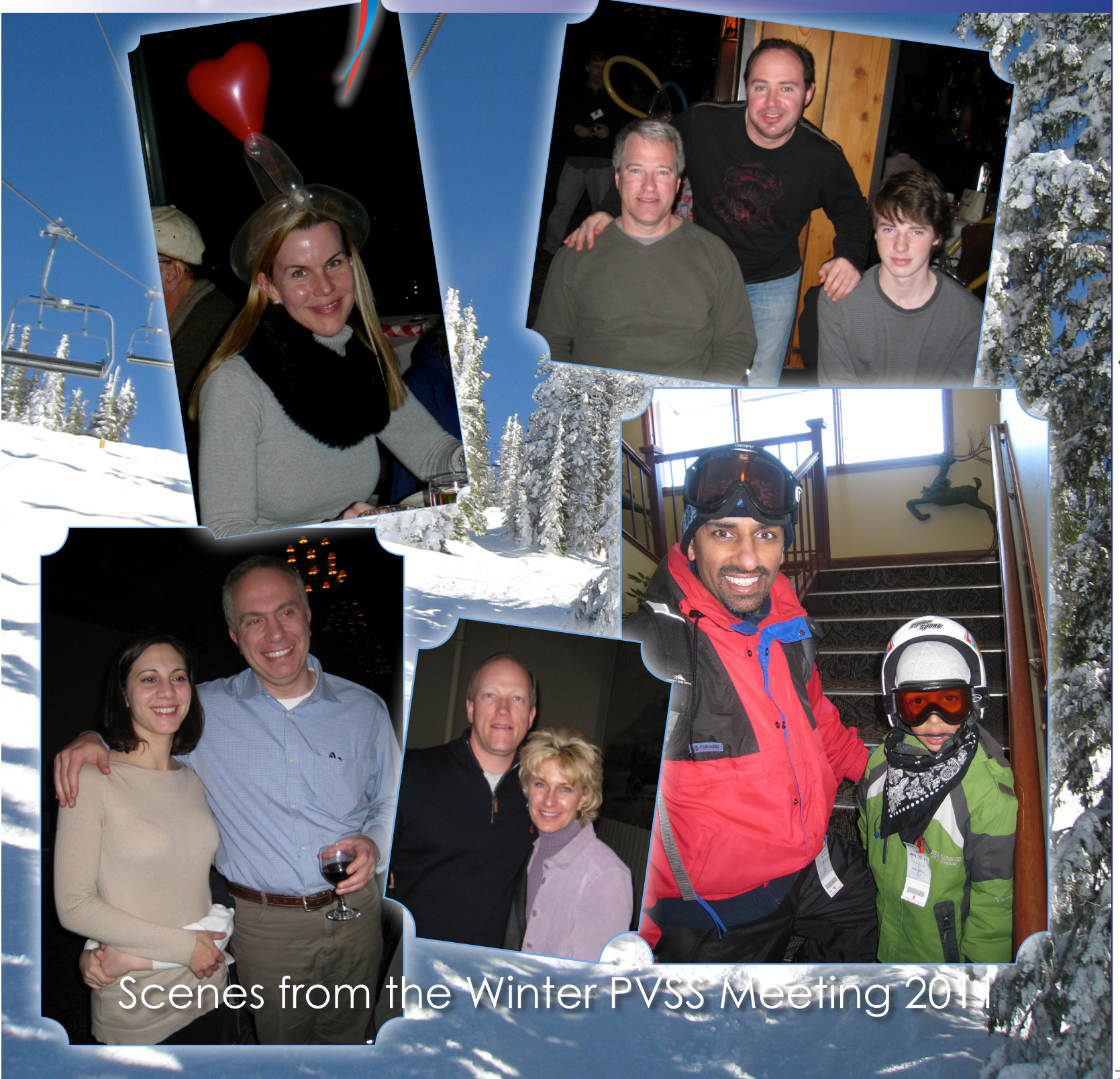
Scenes from the Winter PVSS Meeting 2011