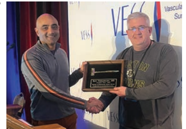
President's Corner continued on page 5

What an amazing experience for a young investigator to be able to present your work in a plenary session and that same day find yourself on the gondola with a member of EC and their children. I returned home and told my wife I planned to attend this meeting every year. Since then, I have missed few and have watched the PVSS develop into the VESS; the premier national society for vascular trainees and surgeons who are early in their careers. Each year, we have seen our presidents continue to support our members through funding research projects, travel scholarships and an ever-expanding program for trainees at the winter meeting. With my presidency, I plan to carry this torch forward in support of our mission.